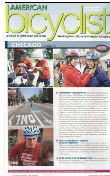
American Cyclist featured Chicago as a city for cycling due in part to the efforts of the Bicycling Ambassadors.