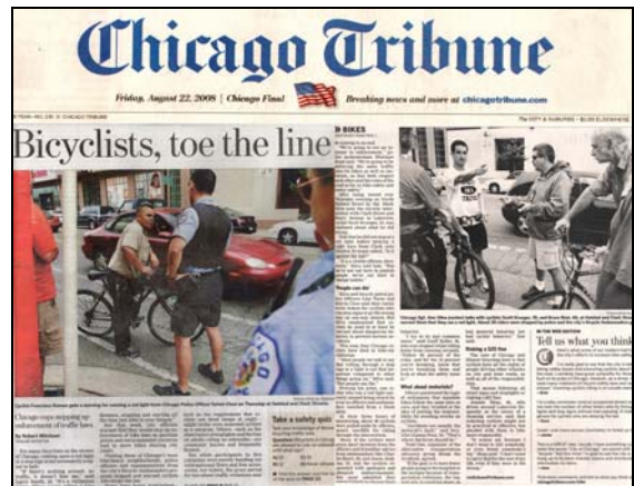
The August 22, 2008 edition of the Chicago Tribune

Due in large part to the Share the Road initiative, Mayor Daley's Bicycling Ambassadors appeared in the media about 20 times this summer. That media exposure reached an estimated 2.5 million people all around the Chicagoland area. Media coverage included a front page story and picture in the Chicago Tribune , an evening feature for our "Share the Road" initiative on CBS 2 Chicago and a radio interview on 1690AM WVON The Voice of Chicago .